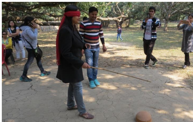
BREAKING THE POT BLINDFOLDED