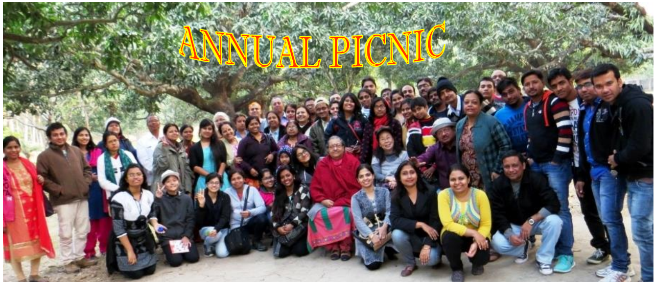
NKKS MEMBERS WITH NATURE

しずむ瀬あれば浮かぶ瀬あり Life has its ups and downs