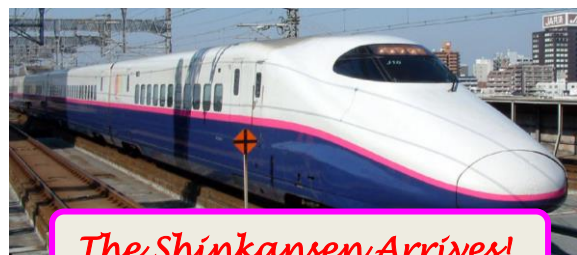
The Shinkansen Arrives!

https://www.youtube.com/watch?v=eSDpSb7A-is