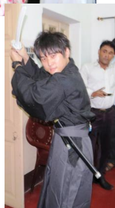
Welcome experience ever.