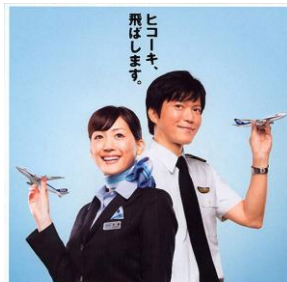
HAPPY FLIGHT ハッピーフライト