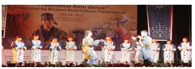
DANCING TO THE TUNE OF NATURE

On 27<sup>th</sup> November, Kolkata got a feel of the ancient culture of the Ainu people at EZCC, Salt Lake. In an effort by the NPO Society to promote Indo-Japan Cultural Relations, Niigata, Japan, Ministry of Culture, Government of India and banglanatak.com, the city got a glimpse of the rich heritage of this naturalistic culture of the Ainu people, who hail from Hokkaido. Currently striving to restore the prestige deserving of this culture to the people, the 18-member dance group made their maiden voyage out Japan to promote awareness for their unique culture, which is essentially steeped in the worship and appreciation of the natural resources around them.