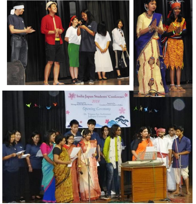
NKKS 344h FOUNDER'S DAY