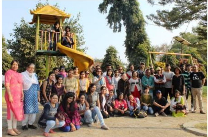
A HAPPY JOLLY GROUP

The Nihongo Kaiwa Kyokai Annual Picnic was held on February 3 at “Garchumuk” in Howrah District. The bus departed from Golpark around 7:30 AM. The picnic spot was a beautiful and tranquil place located at the confluence of the Hooghly and Damodar rivers. Four rooms were booked at the rest house, but most of us spent the day outdoors in the sun. A high bamboo structure in a corner of the compound offered a breath taking view of the waters, and the boats that ply on the river.